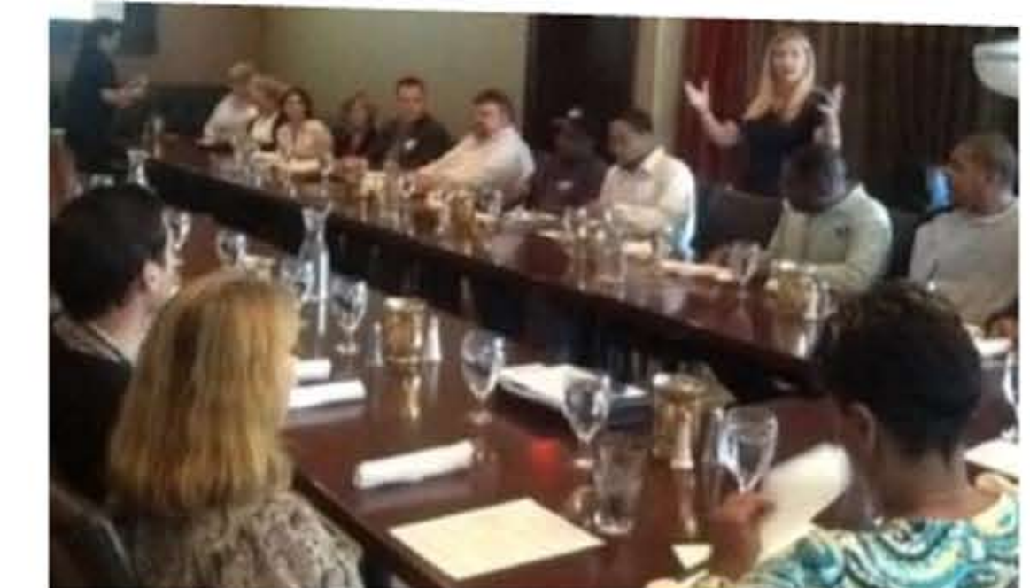
Employer Advisory Outreach Milwaukee Community Service Corps hosts several small shop contractors and environmental conservation orgs to discuss workforce qualifications and nationally recognized credentials.