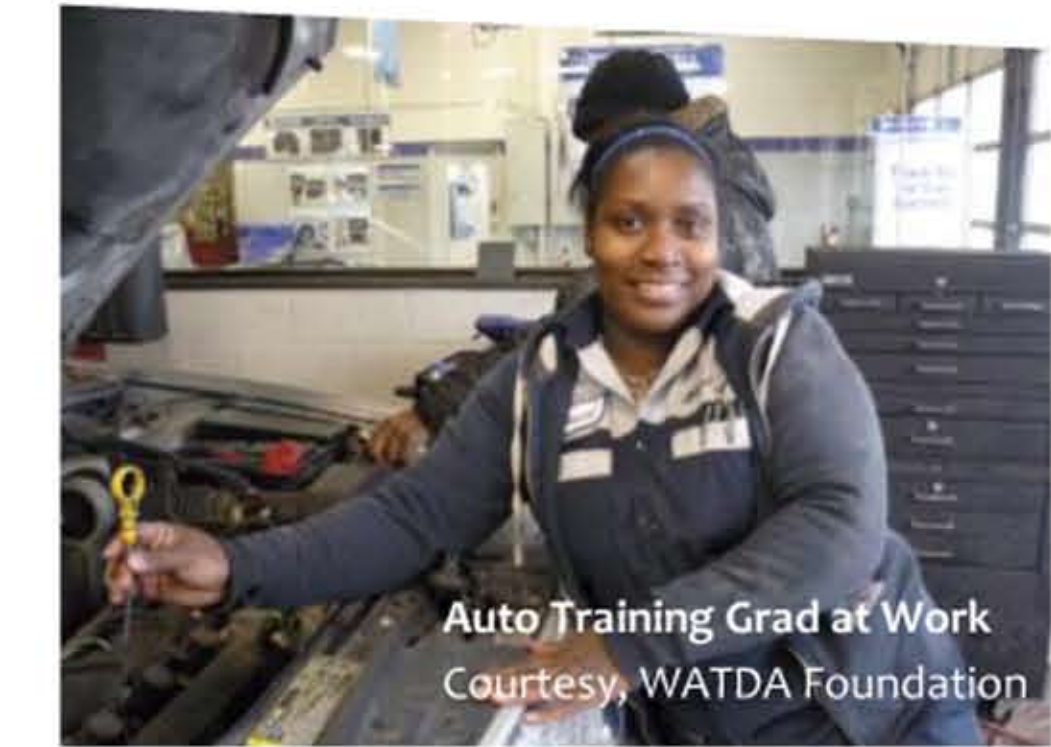
Auto Training Grad at Work