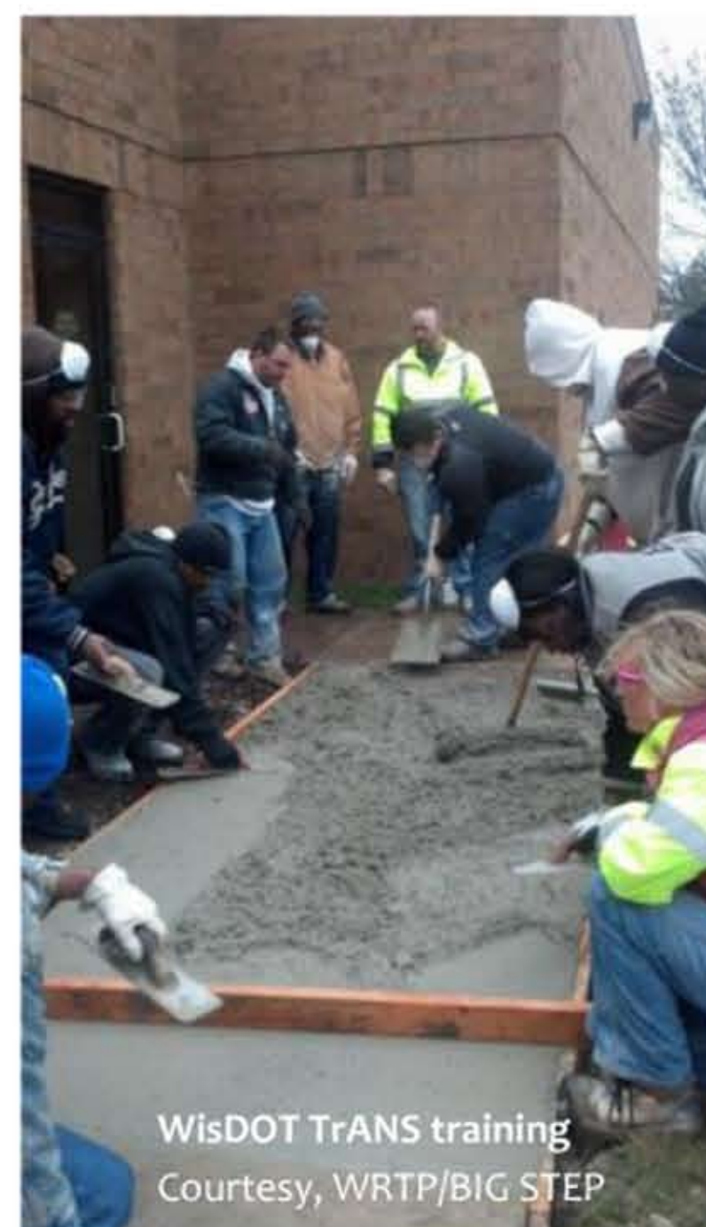
WisDOT TrANS training

WRTP/BIG STEP is Wisconsin's preeminent skilled trade Pre-Apprenticeship access point for career seeking individuals. WRTP creates career access to non-traditional tradespersons namely women, racial and cultural minorities, and youth. WRTP has consistently displayed equal dedication to ensuring well-trained workers can earn family sustaining wages, even at the entry-level.