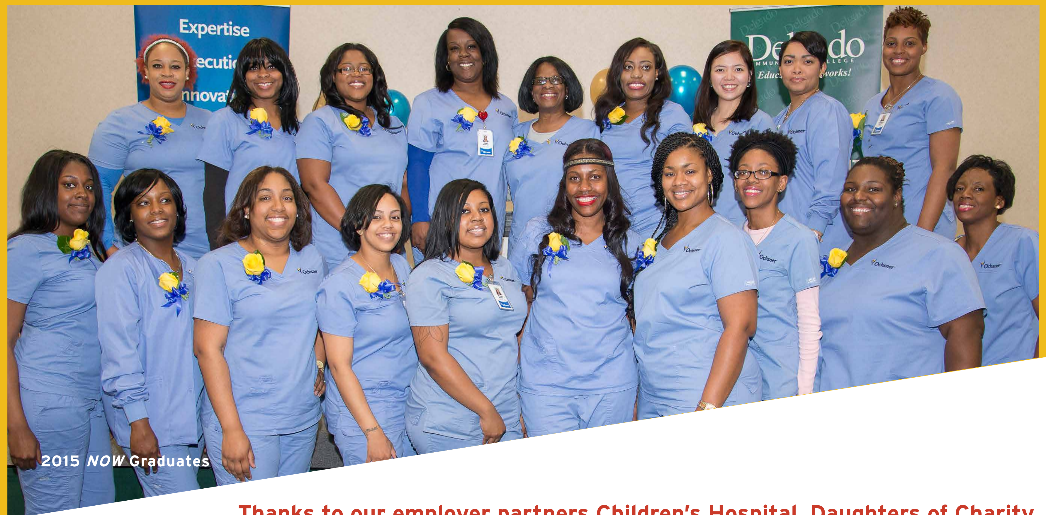
2015 NOW Graduates

To connect a significant amount of low income, low skilled workers to jobs and career ladders that provide the income needed to meet basic needs and develop savings that promote life long and intergenerational economic security.